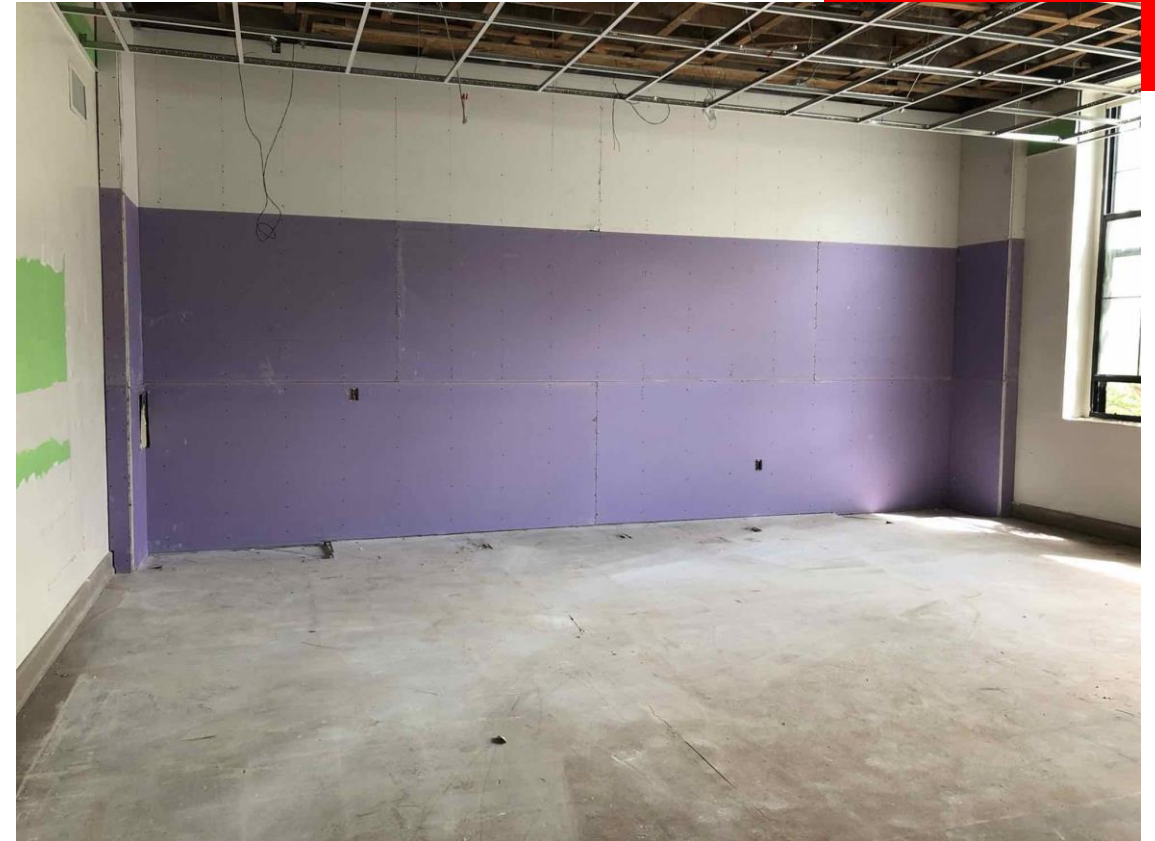
Drywall at Area A