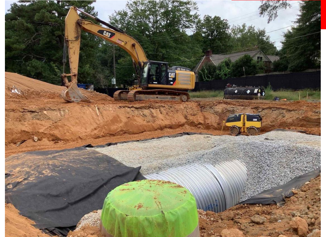
Underground storm pond installation