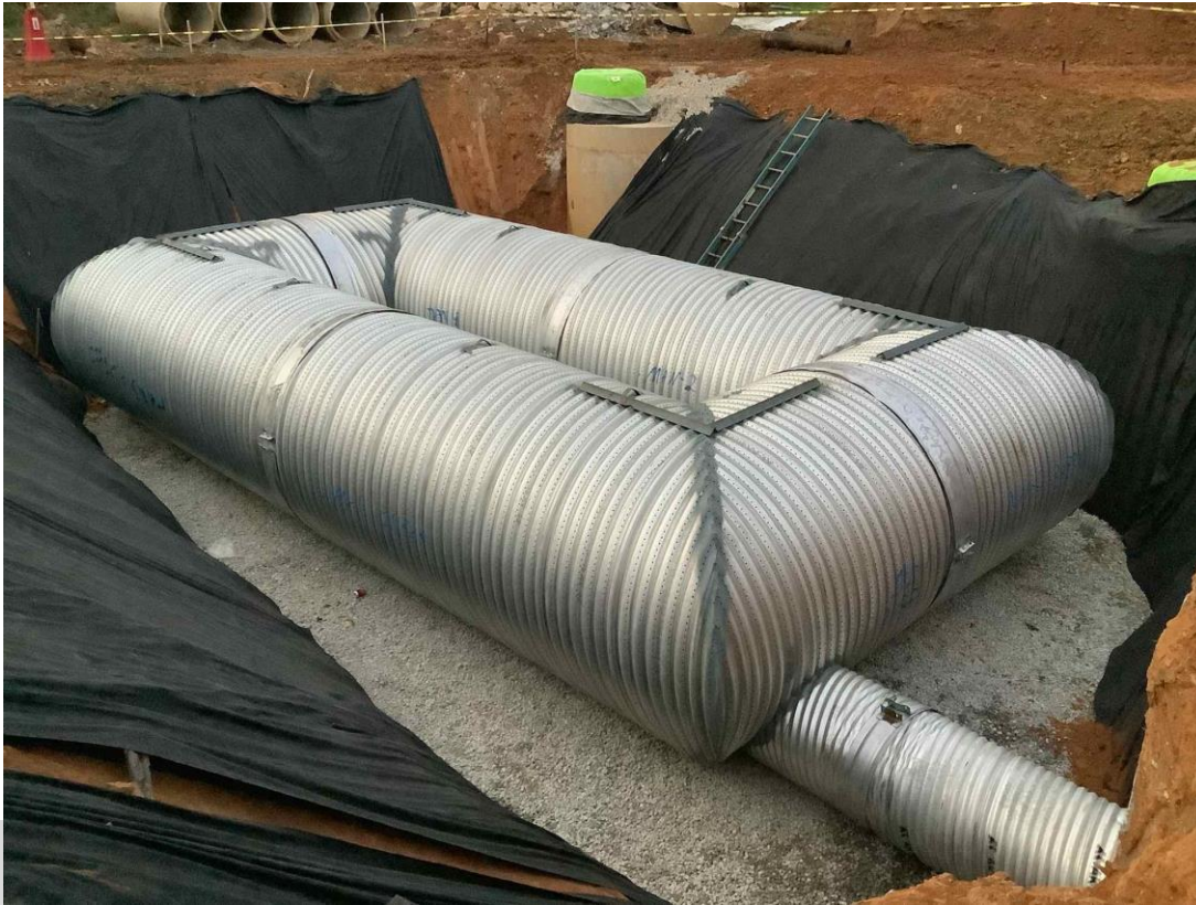
Underground storm pond installation