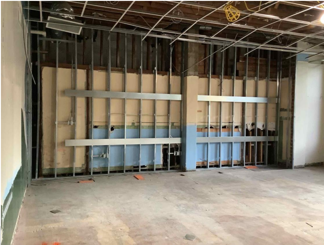
Interior framing at Area A